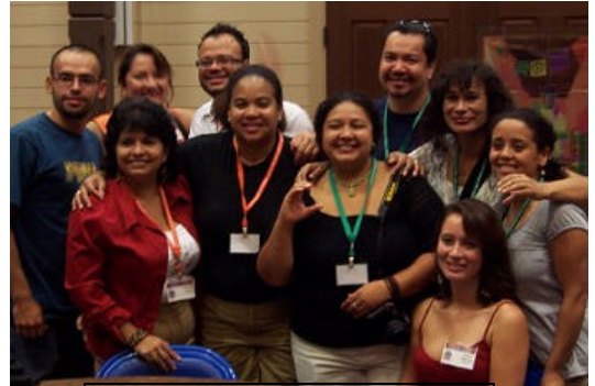
Current Members of the IDLA

I can not believe you (LDHH) pulled this conference off in 6 months and succeeded! I am truly impressed with LDHH and am very inspired.