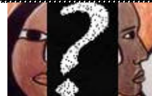
Mystery Person of the Quarter