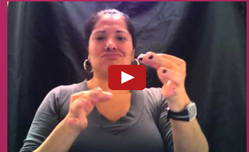
{A deaf Latino woman wearing gray shirt and small round golden hoop earrings is seen in ASL video}