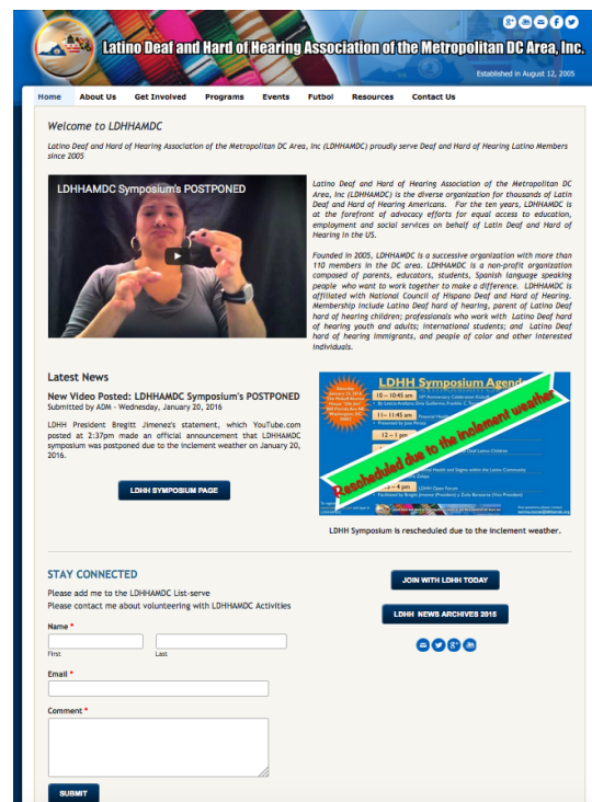
LDHAMDC Home Page